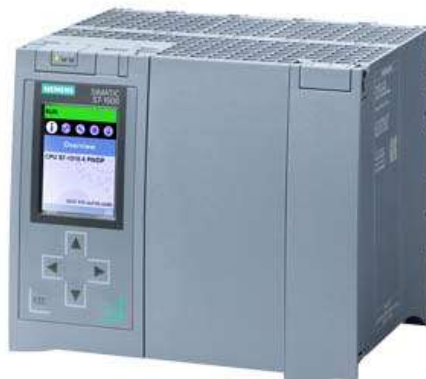
Figure 1 - Simatic S7-1500 illustration

The TOE is managed with TIA Portal V13+SP1 // WinCC V13+SP1.